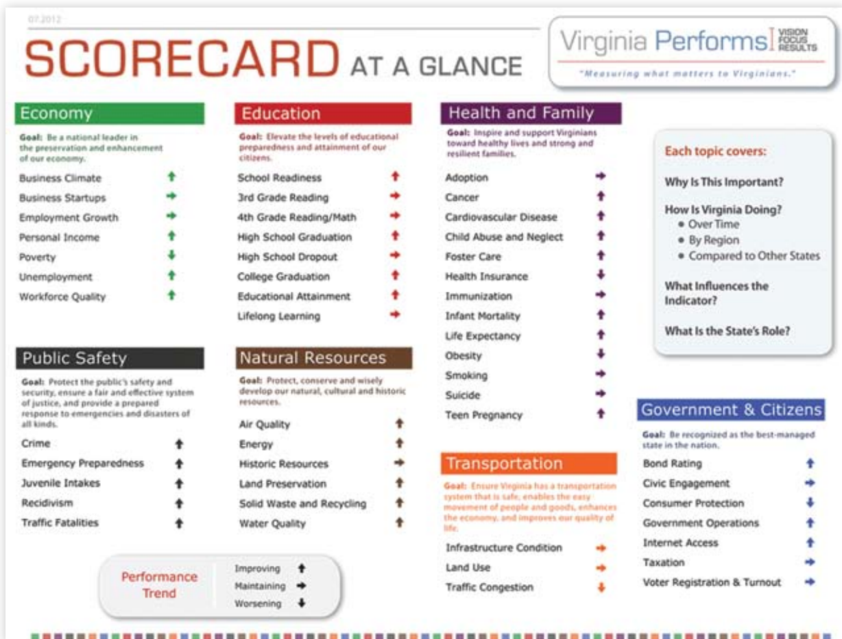
Figure 7.1: THE VIRGINIA PERFORMS SCORECARD AT A GLANCE 21

The Canadian Index of Wellbeing is the only one of our case studies to use a composite index, as opposed to a dashboard approach. This consolidates the 64 indicators within the Canadian Index of Wellbeing into one single average, which they were able to calculate back