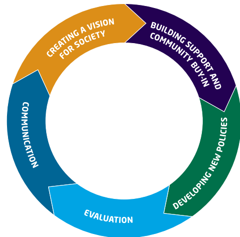
Figure 2.1: USES OF WELLBEING DATA FOR POLICY

The purpose of this report is to offer lessons to policymakers across the UK and other interested parties as the UK publishes its wellbeing data. If the wellbeing data is going to influence policy decisions and not simply be an interesting report produced by ONS, it is imperative that a number of lessons are learned from international experience. This report is structured around five points in the policy-making process plus consideration of the different roles for different tiers of government as follows: