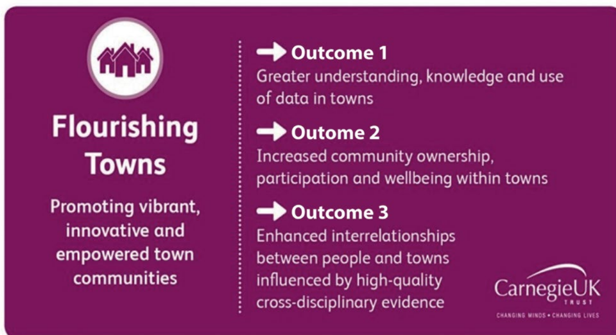
Figure 1: Carnegie UK Trust's Flourishing Towns Outcomes, 2016-2020